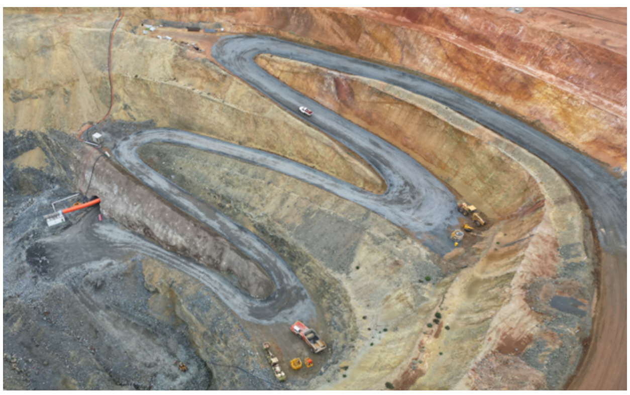
Figure 3 - View of Riverina Portal and access ramp

Development of the Riverina Underground commenced during the quarter. The Riverina portal was established in mid-May and mining has progressed in line with forecasts with total development of 265 metres completed in the six weeks since commencement with 254 metres of this development completed in the declines.