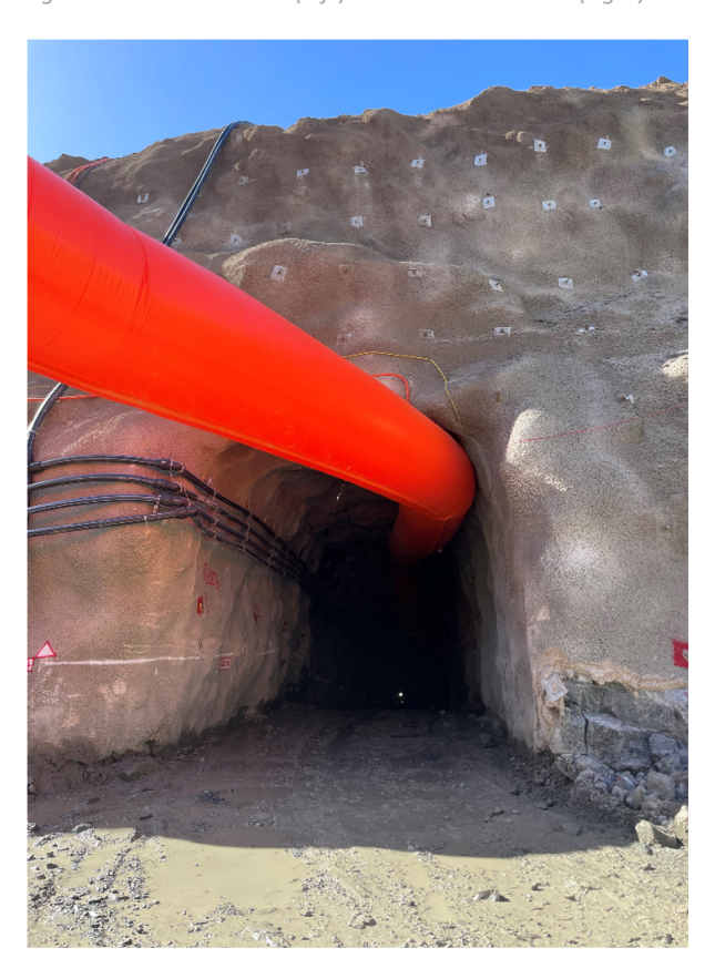
Figure 4 - Riverina Portal (left) and Riverina Decline (right)

A 15.5km pipeline was constructed as part of the integrated dewatering strategy for the existing open pit and underground operations. Primary fans have been purchased, with installation planned next quarter. The primary power station will also be installed next quarter to facilitate the mine expansion.